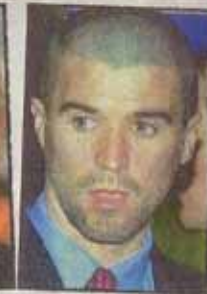
TAKE YOUR PICK . . . Icon Of The Year rivals, from left, Madonna, Geri Halliwell, Michael Caine and Roy Keane

JOHNNY VAUGHAN: The wise-cracking Big Brekkie presenter was last year's winner. Can he do it again this year?